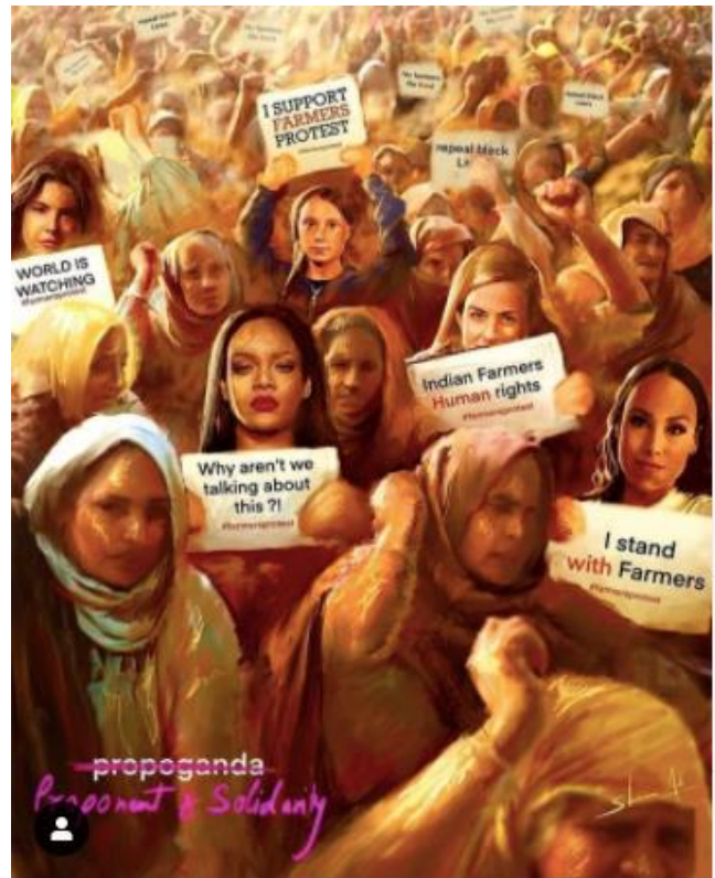
Figure 2

In India, Gender roles play a crucial role in everyone's lives. Women are expected to take care of the family, husband, house, and kitchen. Men are expected to work to make a living for their families and that's all. During the Farmers protest, women who choose to participate were told to go back home because they belonged in the kitchen and this is a matter of men because only men work in the fields..