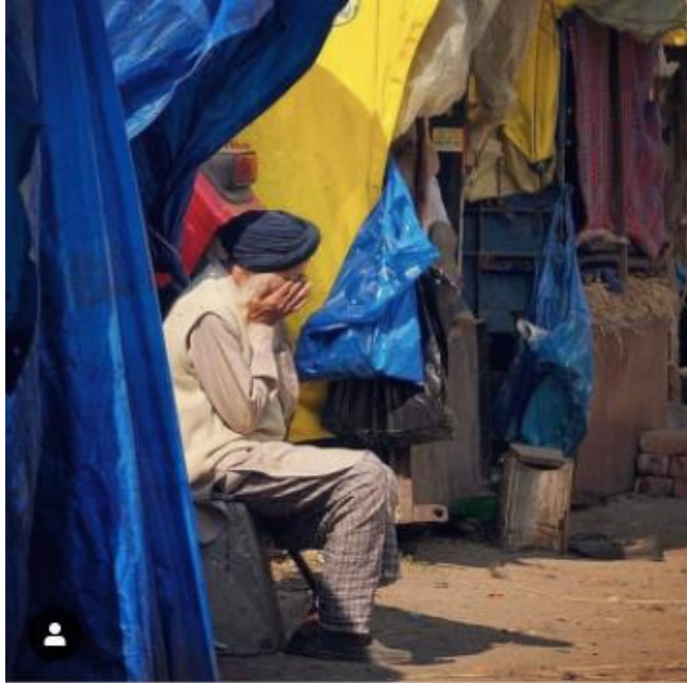
Figure 8

How can we turn our backs to those farmers that feed us every day? Many food supplies that we use today are being transported from India, from those farmers who are being stripped away from their rights. They have always been there to feed us right now it's our time to thank them by showing our support.