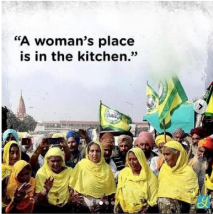
Figure 1