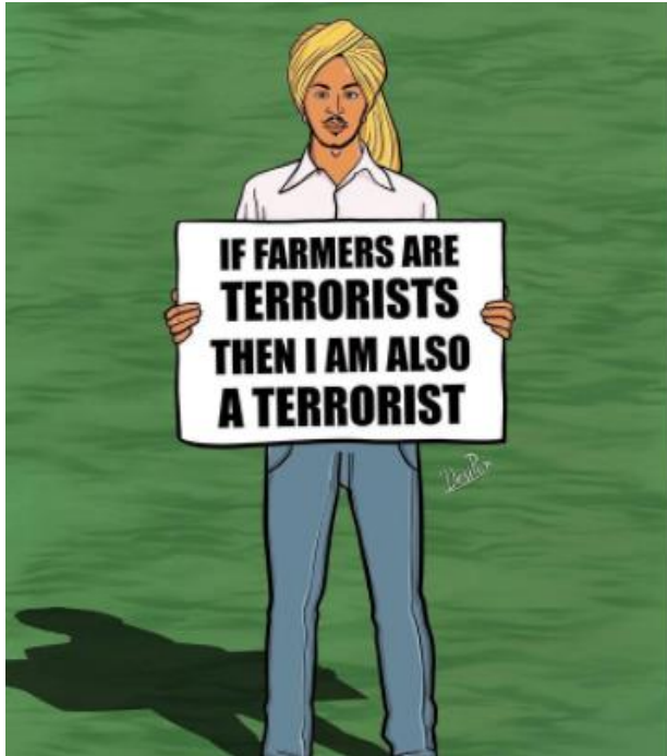
Figure 4