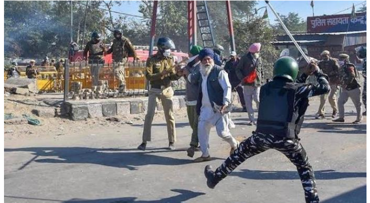
Figure 5

Furthermore, protesting peacefully in India is seen as a threat. Many farmers were labelled as Terrorists, they faced water cannons and batons in this protest by authorities. They faced many situations where they are discriminated against and faced racism. These farmers were protesting peacefully but they reached close to Delhi they were faced with violence many farmers who are seniors were harmed causing many injuries and deaths.