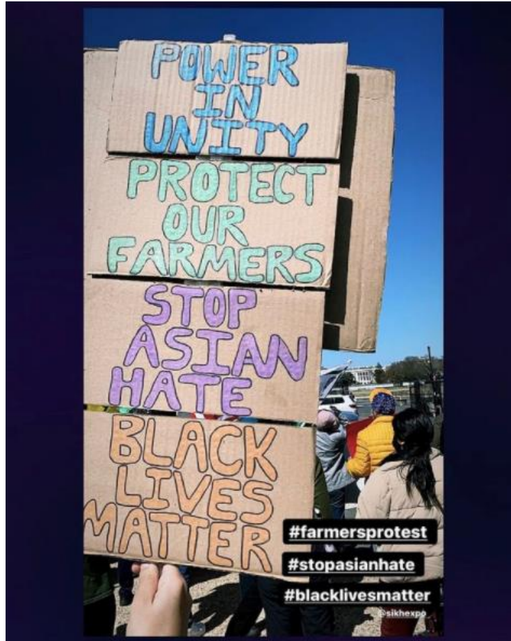
Figure 8

The picture above is from a recent protest in the United States calling for change. As the pandemic continues more and more communities are calling for action for the inequality that they experience. Many farmers are facing racism and inequality in India simply because they are being labelled as a lower class meaning that they should have no say. Similarly, the Asian community is facing hate because of the pandemic. In addition, the black community is suffering from inequality and discrimination for many years. All these three communities have come together to stop hate towards them.